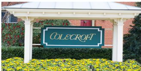
Airport and Washington, DC are minutes away by car or metro.